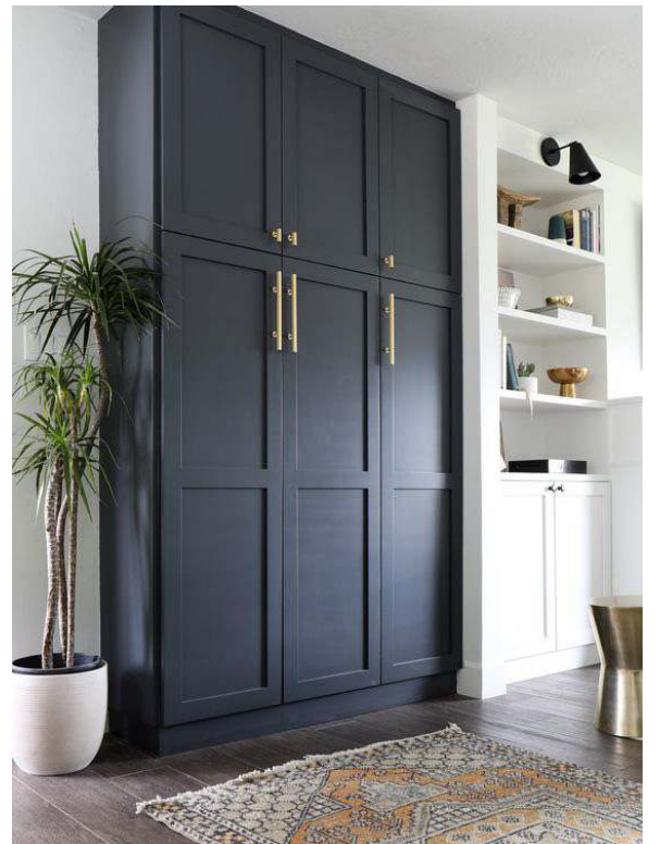
A Murphy bed makes transitioning from bedroom to office easy.

Just like the great room which blends functional space, think about how you can overlap the utility of a room. Using a murphy bed can turn a bedroom into an office space, or a room for the kids to play. Putting a table outside turns a patio into a dining room on pleasant nights.